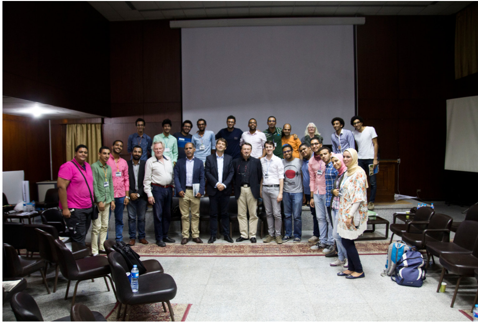
MAS#4 Cairo University

This was the program of MAS # 4 . Seeing the enthusiasm of the students, their thanks messages and further cooperation, encourages us to consider it a very successful event.